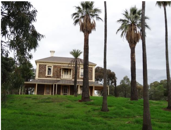
Built in 1877