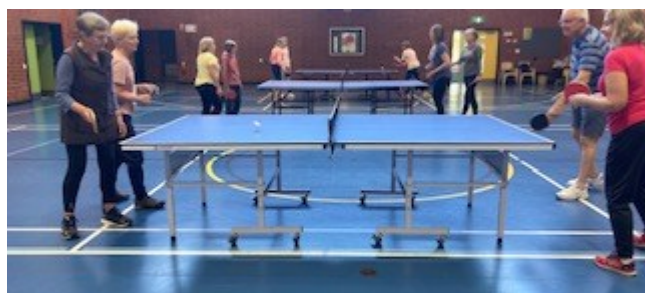
TABLE TENNIS Keeping Active with lots of laughs and good Company!